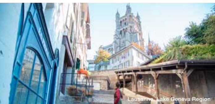
Lausanne, Lake Geneva Region

We look forward to welcoming you to the Switzerland Meeting Trophy!