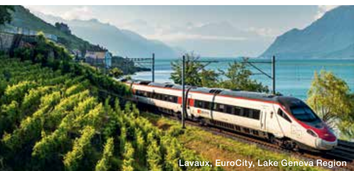
Lavaux, EuroCity, Lake Geneva Region