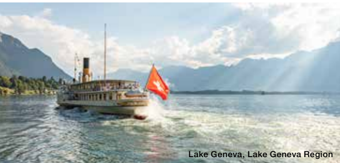
Lake Geneva, Lake Geneva Region

Represent your country at the Switzerland Meeting Trophy! Compete against other meeting planners from all over the world in this race across Switzerland. This challenge is designed to be fun and informative – you will travel by car, bus, train, boat and on foot; while discovering the many venues Switzerland has to offer. The goal may be to win, but the reward for all participants is a greater understanding of Switzerland's meeting destinations.