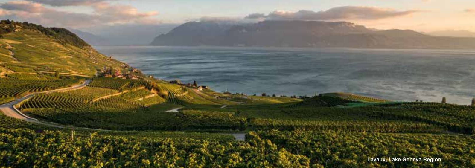
Lavaux, Lake Geneva Region