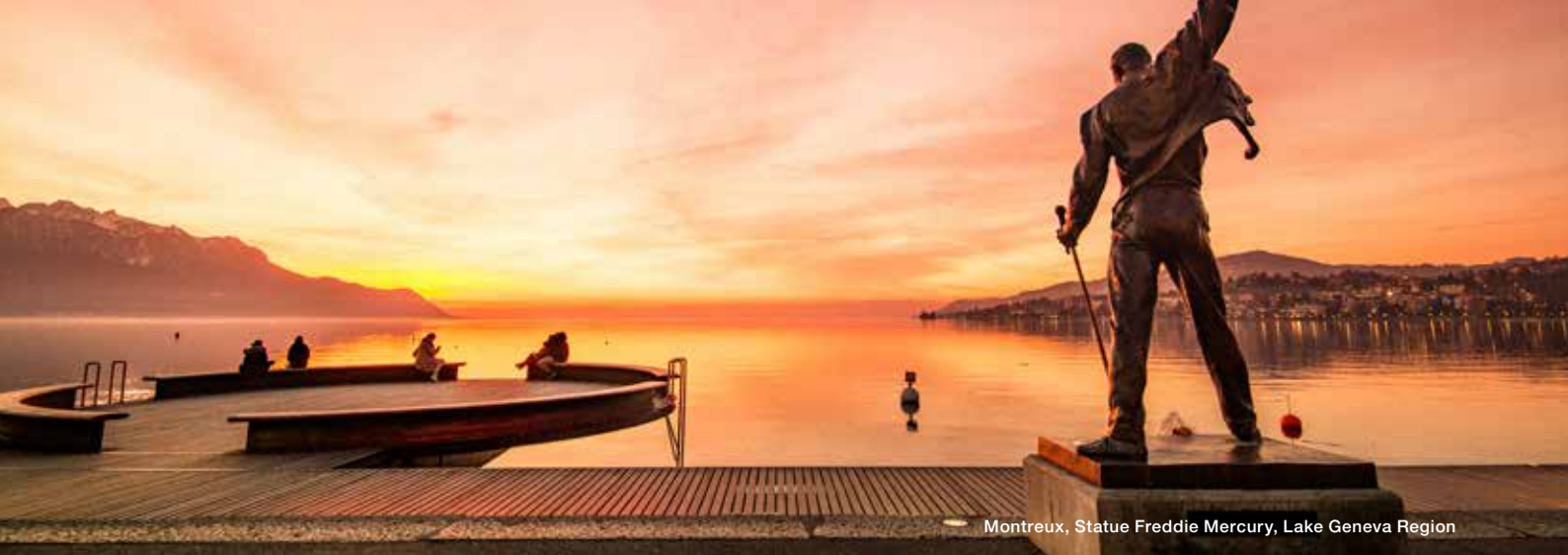
Montreux, Statue Freddie Mercury, Lake Geneva Region