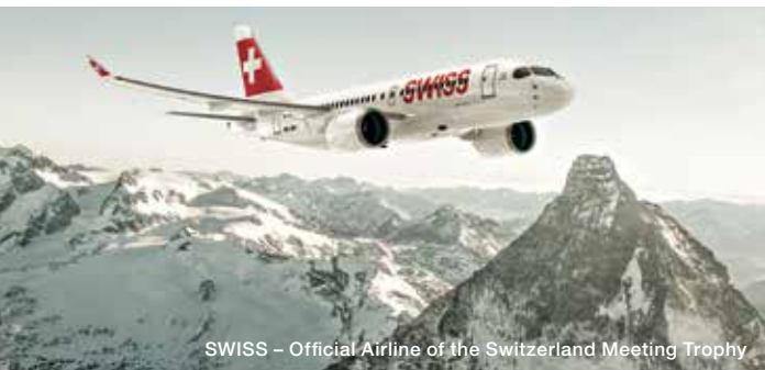
SWISS – Official Airline of the Switzerland Meeting Trophy

This event is of great value to industry professionals and attracts even the most experienced event managers. We guarantee that the time you invest is well rewarded!