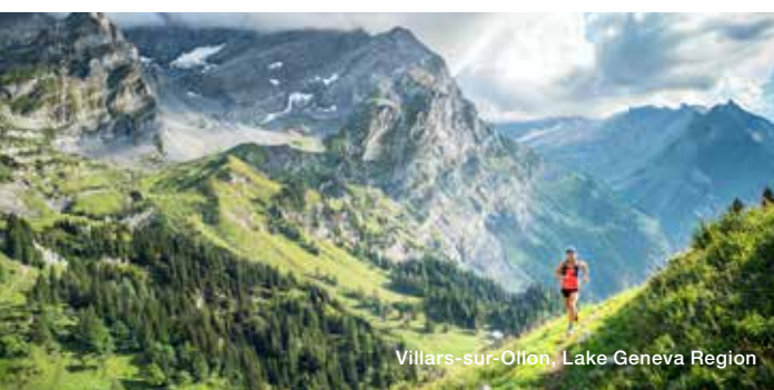
Villars-sur-Ollon, Lake Geneva Region

There is always a risk of accident or sickness involved when participating in such events and trips. In addition to the current acute risk of becoming infected with COVID-19, there is also the risk that participants will have to go into quarantine if another person participating in the event or trip, or a third person with whom the participant has come into contact, tests positive for COVID-19. Please read our Disclaimer carefully.