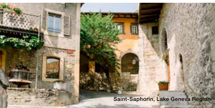
Saint-Saphorin, Lake Geneva Region