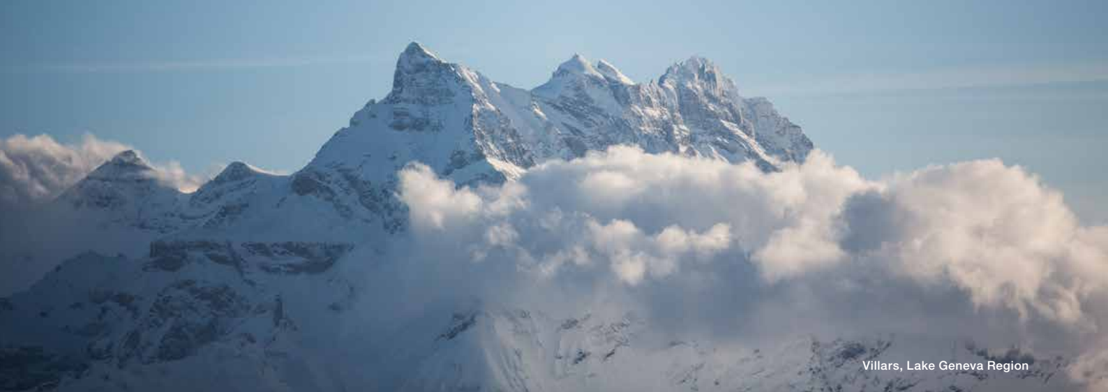
Villars, Lake Geneva Region